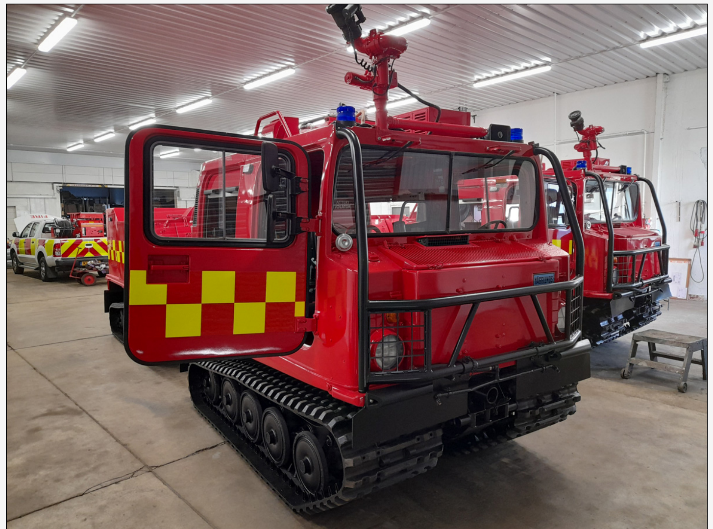
Hagglund BV 206 Fire Vehicle